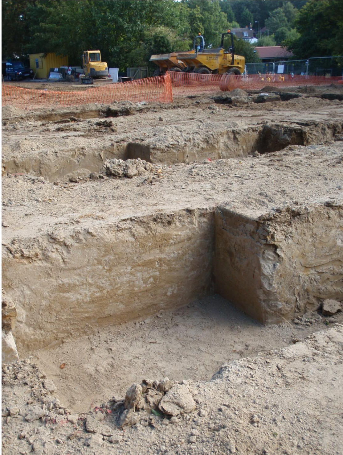
Plate 1. Showing natural geology and foundation trenches for new school