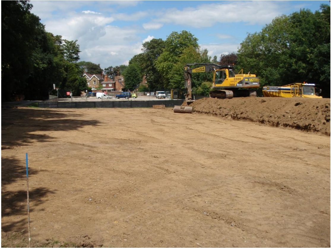
Plate 2. Showing topsoil strip prior to construction of car park (facing north)