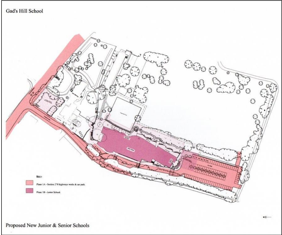
Figure 2. Indicative plan of the two phases of construction